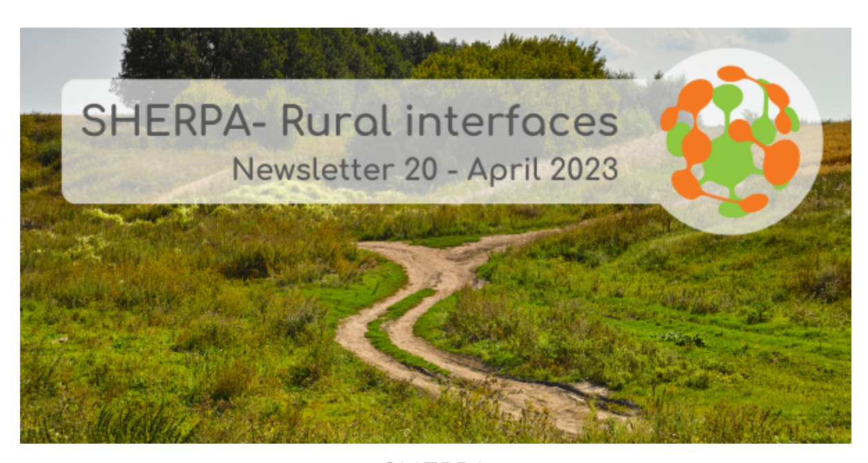
SHERPA Final Conference

Register now so you don't miss the SHERPA Final Conference! The event will take place on 1-2 June at the European Committee of the Regions in Brussels, Belgium.