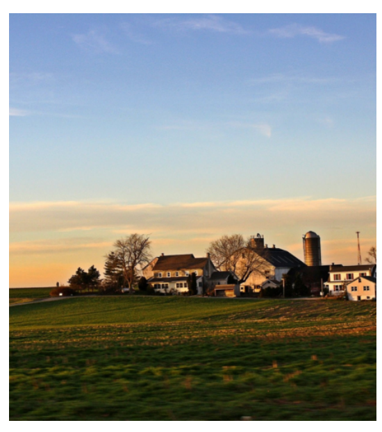
RUSTIK: first report on rural functional areas

RUSTIK published its first report! In this report, it define the concept of Functional Rural Area as well as the differences and similarities with the current definitions of rural areas at the European level (including EU and non-EU countries).